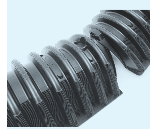
"Lock and Drop"