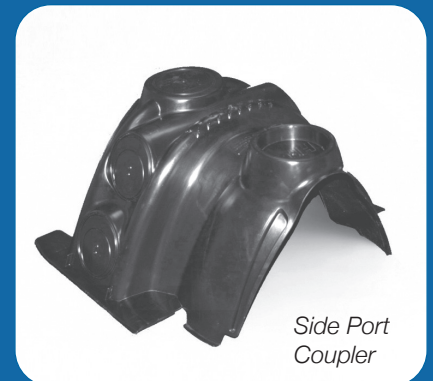
Side Port Coupler