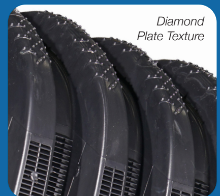
Diamond Plate Texture