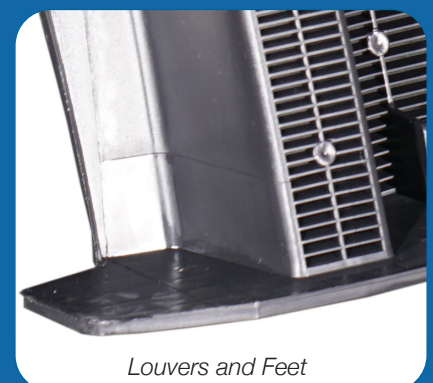
Louvers and Feet