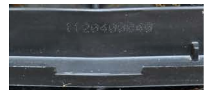
Location of serial number