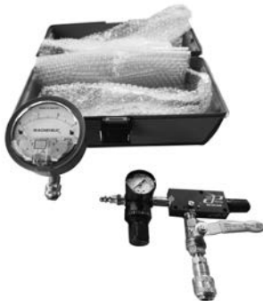
Portable Venturi valve kit