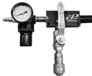
Portable compressor Venturi valve assembly