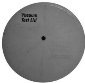
Vacuum Test Lid