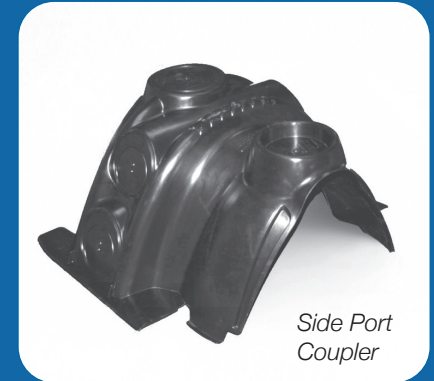
Side Port Coupler