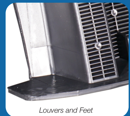
Louvers and Feet