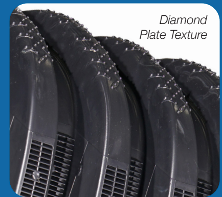
Diamond Plate Texture