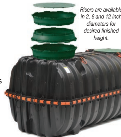
Risers are available in 2, 6 and 12 inch diameters for desired finished height.

The EZsnap Risers come in multiple heights to generate the desired finished grade. Each Riser is tapered to have a large end and small end align like-diameter ends of riser segments. Rotate until the tabs on the upper riser segment drops into alignment on the lower riser segment. With tabs in alignment, push directly down on the top rim of the upper riser segment until the connection tab engages into the lower riser segment. A rubber mallet may be necessary to engage the tabs by hitting on the top surface of the riser if manual pressure is not adequate.