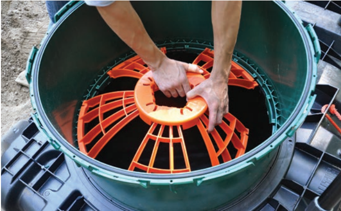
Infiltrator's five arm Safety Star system is equipped with a folding arm for easy installation.