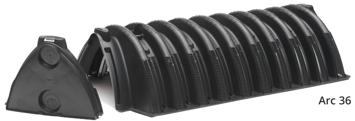
Arc 36 HC

Leaching chambers are rapidly becoming the product of choice for leachfield applications over conventional pipe and gravel systems. Their lightweight construction offers lower installed costs and less intrusive installations.