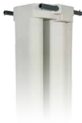
Rotational molded polyethylene housing with UV inhibitors for durability and shelf life.