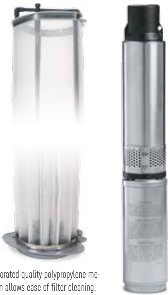
Perforated quality polypropylene medium allows ease of filter cleaning.

The powerful, yet lightweight DE Series features stainless steel construction, built-in overload and electric surge protection. Delta offers a wide range of pump selection for any application and incorporates features designed from our years of experience to provide you with trouble-free service.