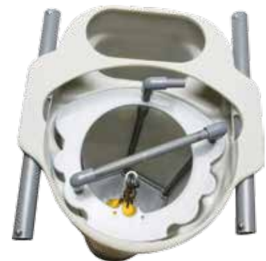
The ECO FILTER features a dual compartment design housing which can be used for your simplex or duplex application needs.