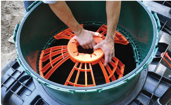
Infiltrator's five arm Safety Star system is equipped with a folding arm for easy installation.