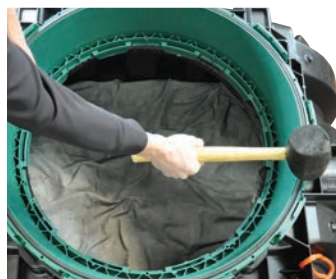
Use mallet to engage the rest of the tabs.