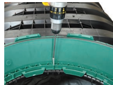
Screws required for riser to tank connection only.

Riser, narrow end down into the IM-Tank opening. Rotate the riser until the riser connection tabs align with the tank indexing tabs on the tank opening. Screw pilot holes will be in alignment on the riser and tank when in proper position. On one side of the tank insert the riser connection tabs into the tank indexing tabs and engage into the proper position. Then using a rubber mallet pound down on the top of the riser engaging the rest of the tabs. It is helpful to move around the circumference of the tank opening. It is required for the tank to riser connection only to secure the connection with the supplied (10) #12 High-Low 1-3/4" stainless steel screws. Tighten screws in a "star" pattern, tightening screws on opposite sides of the EZsnap Riser.