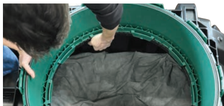
Engage one set of tabs into proper position.