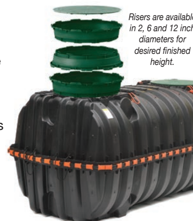
Risers are available in 2, 6 and 12 inch diameters for desired finished height.

The EZsnap Risers come in multiple heights to generate the desired finished grade. Each Riser is tapered to have a large end and small end align like-diameter ends of riser segments. Rotate until the tabs on the upper riser segment drops into alignment on the lower riser segment. With tabs in alignment, push directly down on the top rim of the upper riser segment until the connection tab engages into the lower riser segment. A rubber mallet may be necessary to engage the tabs by hitting on the top surface of the riser if manual pressure is not adequate.