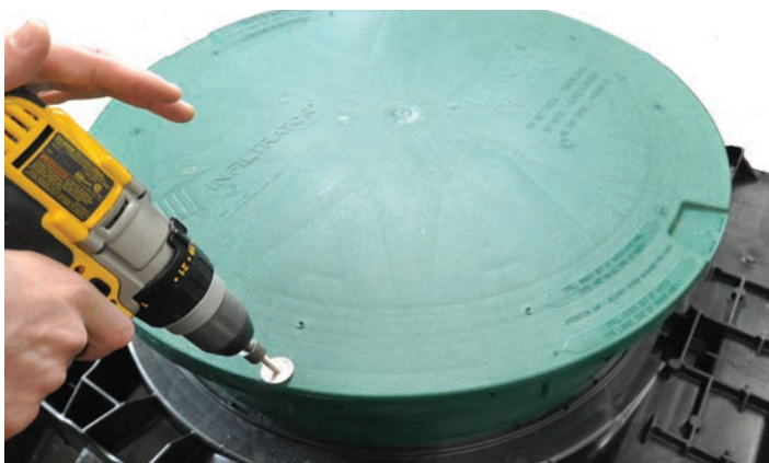
Fasten the lid to the riser with screws provided prior to backfilling.

Use the ten #14 stainless steel screws provided to fasten the lid to the riser. There are nine (9) hexagonal head