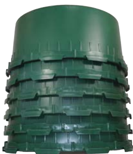
Risers nest together for efficient shipping.

Note: The EZsnap Riser segment includes factory-installed gaskets on both ends of the riser segment, so the application of a sealant or mastic on the connection surface is not required. Proper care must be taken to ensure the gasket surface is clean and free of debris. It's recommended that all gaskets and connection surfaces be wiped clean. Each riser section