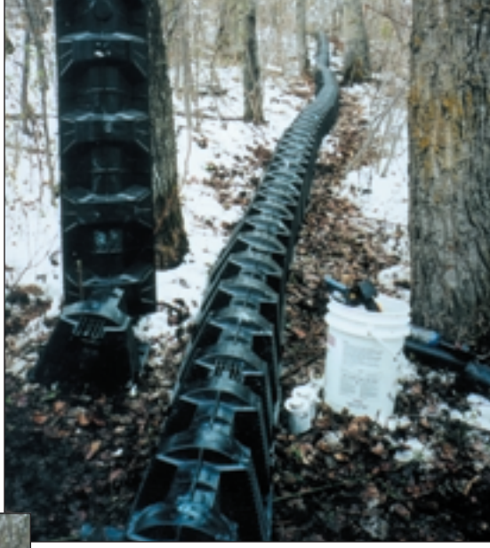
A 225-foot lateral of Equalizer 24 chambers contour through trees and are placed directly onto undisturbed humus layer.

leaf decomposition. This distribution piping is covered by an open bottom chamber or a 300 mm (12") or larger \frac{1}{2} -pipe, providing a protective housing that is then covered with wood chips and/or shredded tree cuttings. The forest canopy provides additional insulation in the cold winter