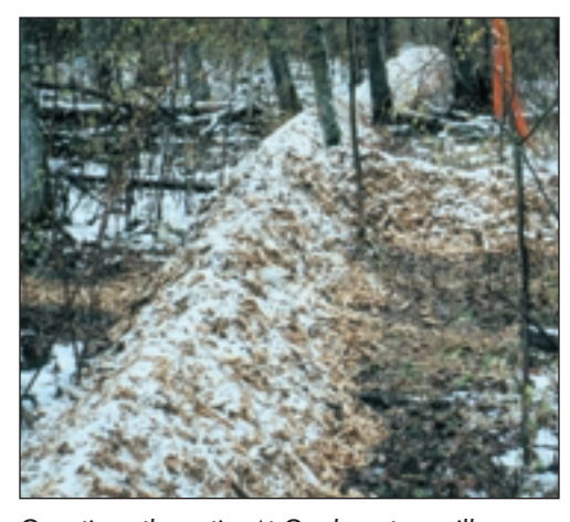
Over time, the entire At-Grade system will soon become a natural part of the forest landscape.

months when weeklong stretches of minus 40°C are not uncommon. Effluent is delivered to the upper, very permeable, layers of soil, where it is quickly absorbed, reducing the risk of human and animal contact with the effluent. The effluent, moving vertically through the upper permeable layers, spreads horizontally over the underlying less permeable soil and slowly infiltrates into the soil to achieve final treatment and return to the environment.