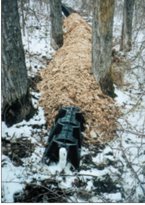
The 1 \frac{1}{2''} PVC piping inside the chamber is supported by injection moulded pipe support units that firmly hold and elevate the piping above the humus layer.

In contrast to typical septic systems, the sewage is first treated to a secondary treatment level typical of an NSF-40 advanced treatment system. It then moves to an effluent dispersal system, which is an arrangement of pressurized distribution piping placed on the humus layer. The humus layer is the 4½ to 5 inches of material that has collected on the site over years of