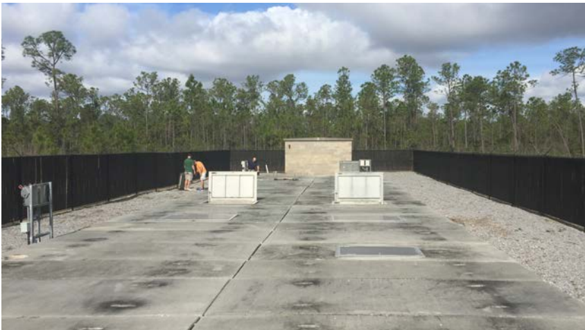
30,000 gallon decentralized system