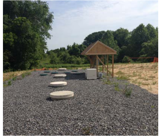
10,000 gallon system servicing a retail development

The ECOPOD houses an engineered plastic media specifically designed to act as a growth medium for naturally occurring bacteria. The media is completely submerged in a reactor tank, which works as a recirculation zone. There are no moving mechanical parts or filters in the ECOPOD. In this system, conditions are favorable only to attached growth bacteria, meaning common disadvantages such as rising sludge, floating sludge or washouts are eliminated. In addition to CBOD and TSS reduction, ammonia nitrogen is reduced as nitrification of the ammonia and denitrification of nitrates occurs within the bacterial masses.