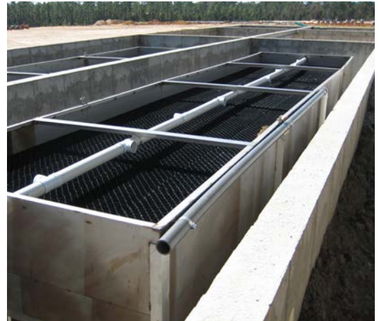
Easily installed into poured in place concrete tanks