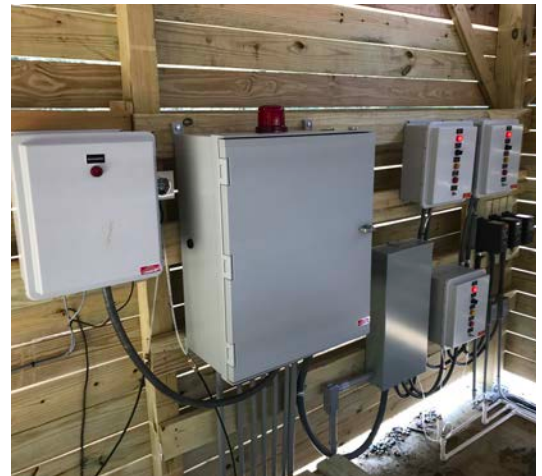
Electric control console provides complete and simple operation