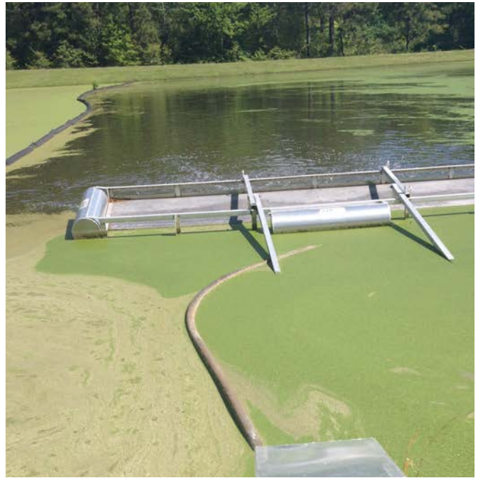
Lagoon Water Nitrification