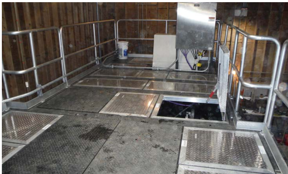
2 Completely enclosed and insulated

Delta's extended aeration plants utilize the activated sludge process which allows naturally occurring bacteria to break down and oxidize organic contaminants in domestic wastewater. With the combination of aeration, clarification, and disinfection, the influent organic biological loading is consumed and converted into a highly treated, clear and odor-free effluent, allowing for subsurface disposal or direct discharge within stringent regulatory permits requirements.