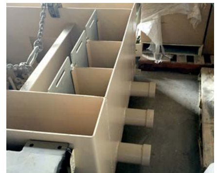
Flow Distribution Chamber