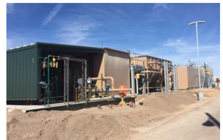
Complex treatment system servicing industry needs.