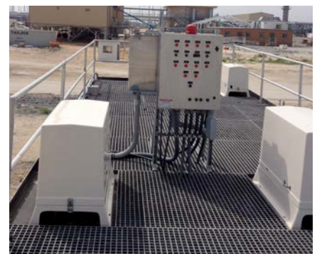
Electrical Control Console