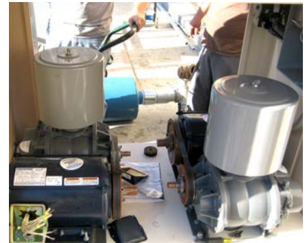
Air Blower Unit

Secondary flow equalization and tertiary treatment systems could include aeration, settling, filters, clearwell chambers, disinfection methods and other ancillary equipment such as blowers, pumps, electrical controls, aeration equipment, filter media and liquid level sensors. Other options such as gratings, handrails, stairways, UV treatment, and flow measuring equipment can be provided. A Delta Treatment Systems representative can assist you in specifying the system that will meet your requirements.