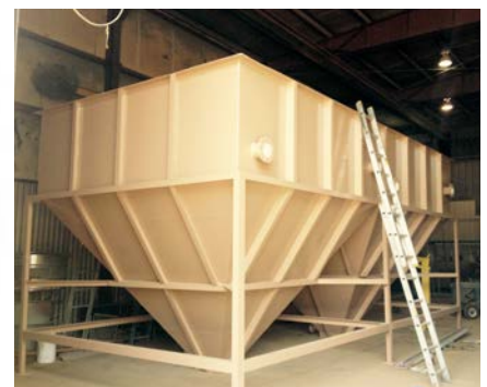
Secondary Clarifier with Chlorination